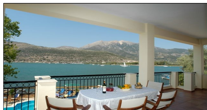
Villa Mahera - One of Two Sea-View Balconies

These Prices are without Flights and Transfers etc. - Villa Only.