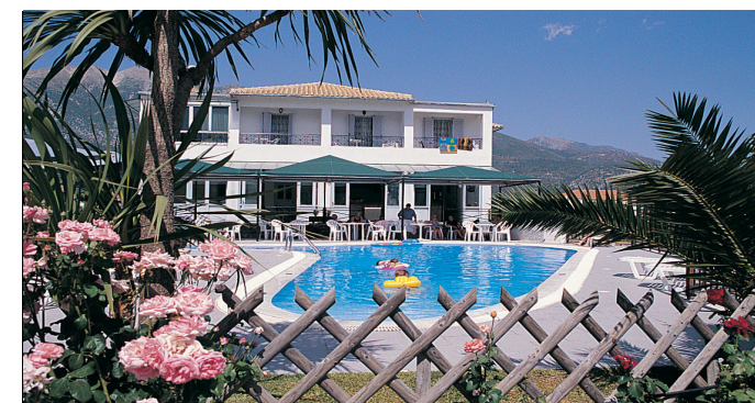
Armonia Hotel - Waterside View